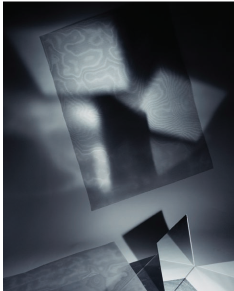
Images (top) Barbara Kasten, Architectural Site 17, August 29, 1988 , 1988. Cibachrome. 60 x 50 inches. Location: High Museum of Art, Atlanta, GA. Architect: Richard Meier; (bottom left) Barbara Kasten, Construct VIII , 1982. Polaroid. 10 x 8 inches; (bottom right) Barbara Kasten, Scene III , 2012. Archival pigment print. 53 \frac{3}{4} x 43 \frac{3}{4} inches.