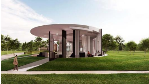
Serpentine Pavilion 2020–21 designed by Counterspace. Design render, exterior view. From the 2020 organizational grant to Serpentine Galleries for the exhibition Serpentine Pavilion 2020–21 designed by Counterspace