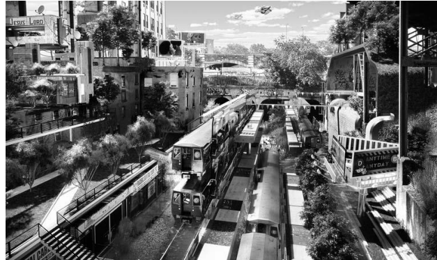
Olalekan Jeyifous, ...other seasonal occupancy neighborhoods , 2020. The Museum of Modern Art, New York. From the 2020 organizational grant to The Museum of Modern Art for the exhibition Reconstructions: Architecture and Blackness in America